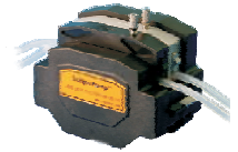
DG15-24 DG15-28 DG15-48