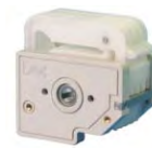
DG-2 I DG-24