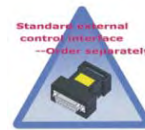
Standard external control interface --Order separately